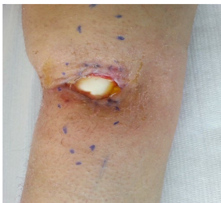
Figure 2. Vastus intermedius muscle, cadaveric dissection

The flap completely healed and the stitches were removed after 21 days. The patient was discharged in the fifth day post-op and came to the outpatient department once a week for medical dressing. Cephazoline therapy at 2 g per day was administered for 14 days. After 2 months the previous surgical access was used to allow the orthopedic surgeon to substitute the antibiotic-loaded bone cement with a definitive prosthesis. During a two-years follow up examination the flap is still good, the tissue is soft and pliable, the coverage is optimal (Figures 3,4) Furthermore the patient walks without crutches.