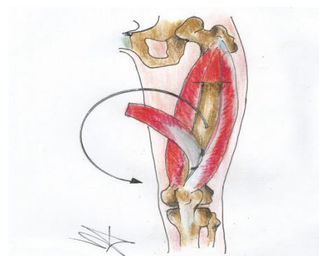
Figure 7. Vastus intermedius after complete rotation for defect covering

The survival of the flap was checked once again, hemostasis was performed and then the flap was covered with a split thickness skin graft and sutured with a tie-over dressing. The muscle margins were inserted beyond the skin edges of the debrided area. No drains were positioned. Cephazoline was administered as prophylactic therapy.