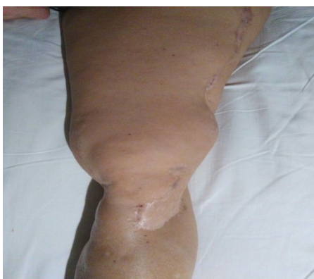
Figure 4. Follow- up at two years later aspect.

The reliability of this muscle as a flap was investigated with a handheld Doppler probe and then it was dissected tracing its multiple nourishing vessels originated from the lateral circumflex femoral artery. The dissection proceeded in a proximal to distal way and after the pedicles were exposed progressively the vessels were clamped starting from the most cranial to the caudal one, collocated a few centimeter from the rotula.