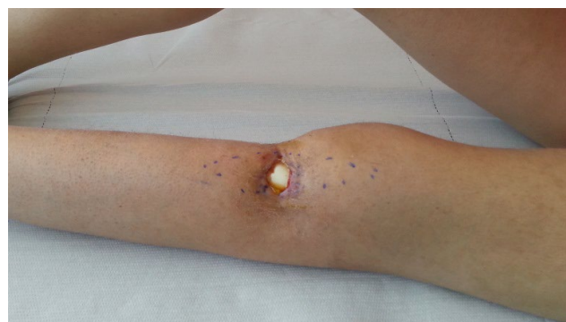
Figure 1. Preoperative aspect

The patient finally came to our Hospital, where exposition of the antibiotic-loaded bone cement with a defect of 5 cm × 4 cm (Figure 1) led the orthopedic surgeon to consult our Team in order to perform a combined amputation and flap coverage of the stump.