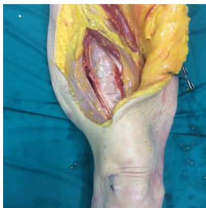
Figure 3. Follow-up at two years frontal aspect.

The flap completely healed and the stitches were removed after 21 days. The patient was discharged in the fifth day post-op and came to the outpatient department once a week for medical dressing. Cephazoline therapy at 2 g per day was administered for 14 days. After 2 months the previous surgical access was used to allow the orthopedic surgeon to substitute the antibiotic-loaded bone cement with a definitive prosthesis. During a two-years follow up examination the flap is still good, the tissue is soft and pliable, the coverage is optimal (Figures 3,4) Furthermore the patient walks without crutches.