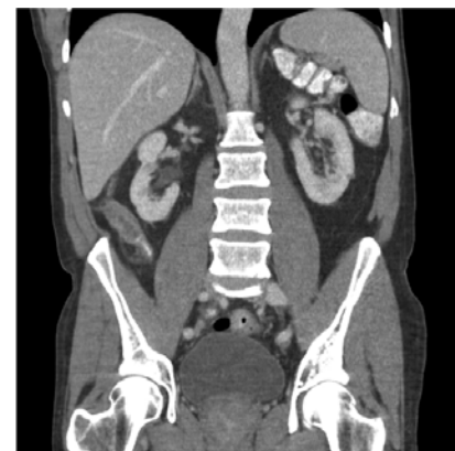
Figure 1: CTAP – A coronal reconstruction view showing a thickened appendix with surrounding abnormal inflamed tissue.

Tegafur, unfortunately he developed enterocolitis, which necessitated hospital admission and treatment with intravenous antibiotics, steroids and fluids. Tegafur was stopped and he is currently waiting to see the Oncologists about the need for ongoing chemotherapy.