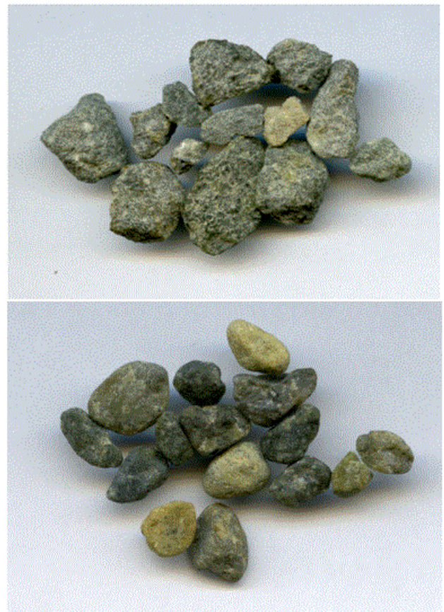
Figure 2: Before the experiment, the olivine grit is angular and rough (top), after a few days of quiet rotation the grains are rounded and polished (bottom).

An often heard objection is that the process would be too slow. It is a slow process, but it doesn't matter that it takes a few years before the olivine grains are completely weathered. For the climate that is good enough, and quite a bit quicker and more effective than all those big international climate meetings together.